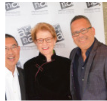
Hot Night in the City 2014: Celebrating ...