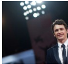
James Franco apologies for Instagram ...