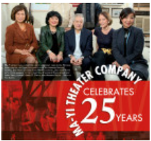
Ma-Yi Theater Company: 25 Years and Beyond