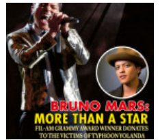
Bruno Mars shows that he's more than just ...