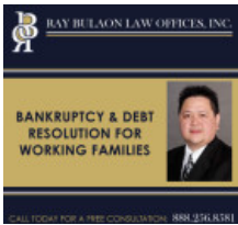
Need to file bankruptcy but worried about ...