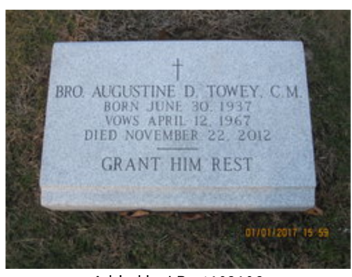
Added by LBurt102106