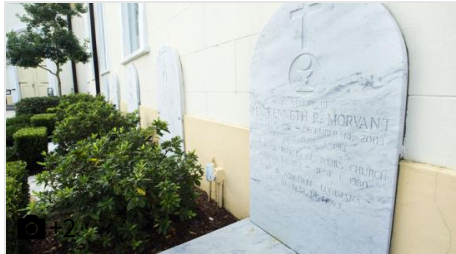
Diocese of Lafayette priest abuse list prompts questions about new, missing names