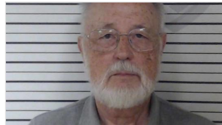
Former Lafayette priest who admitted abusing altar boy to be sentenced Tuesday