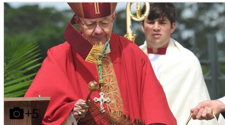
Lake Charles diocese, with so many ties to Lafayette, opted for transparency with priest abuse lists