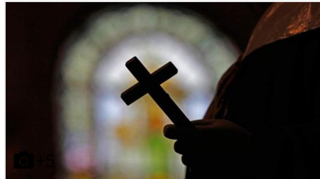
Lafayette Diocese releases list of clergy members with credible abuse accusations