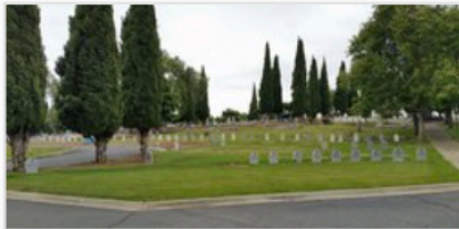
Added by wartsnall